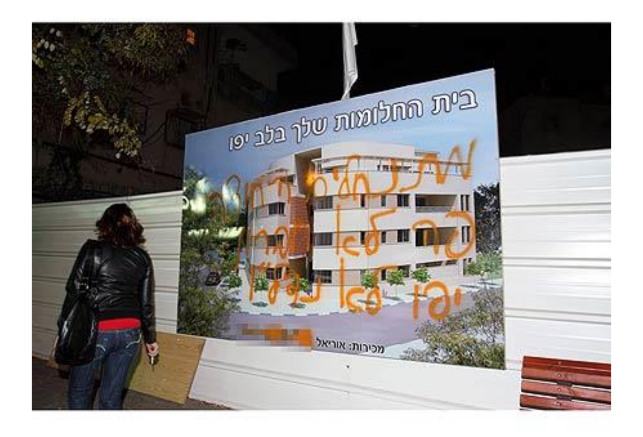
Figure 4. The graffiti reads: "Settlers Out. It is Not Hebron Here. Jaffa in No Real-Estate" (2012).