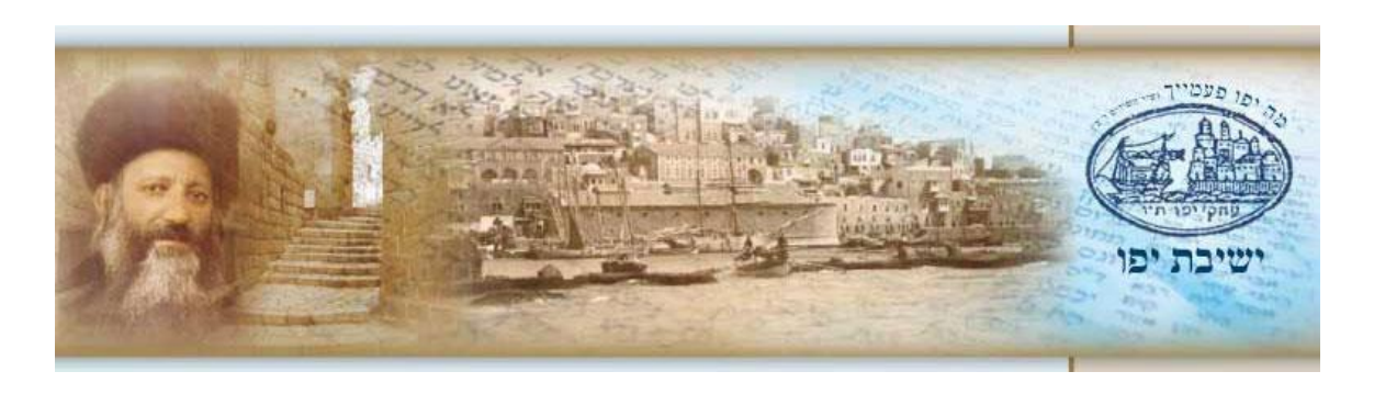
Figure 3. The logo of the Jaffa Yeshiva featuring the figure of Rabbi Kook, Jaffa's Rabbi circa 1904.